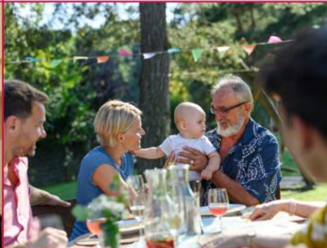
Humanist baby naming ceremony