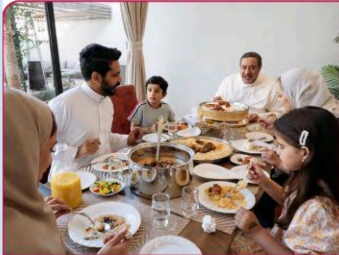
Adhan and Aqiqah