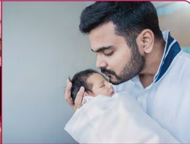
Jatakarma and Namakarana