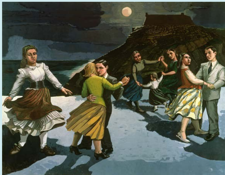
'The Dance', 1988 (acrylic on paper laid on canvas) by Paula Rego