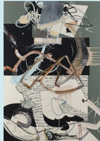
Untitled, 1991 (oil on canvas) by Fiona Rae.