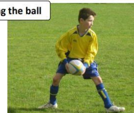
Gripping the ball

2 hands around the ball to grip it correctly.