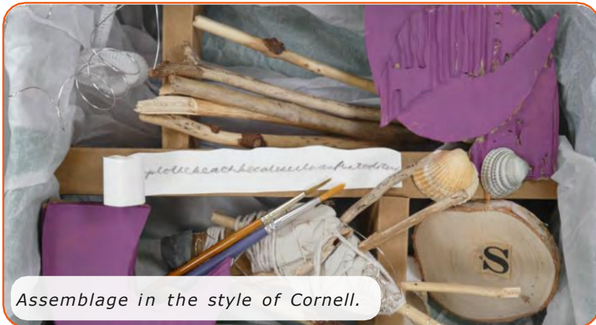
Assemblage in the style of Cornell.

Cornell made 3D art from found objects with personal meaning assembled in a box. He was one of the first artists to create 'Assemblage' art.